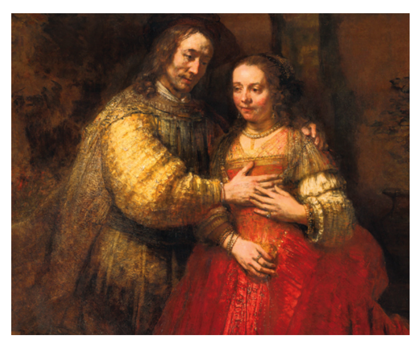
The Jewish Bride, Rembrandt, (Rijksmusem Amsterdam)

Although there is nothing new in this, the internet delivers words and images