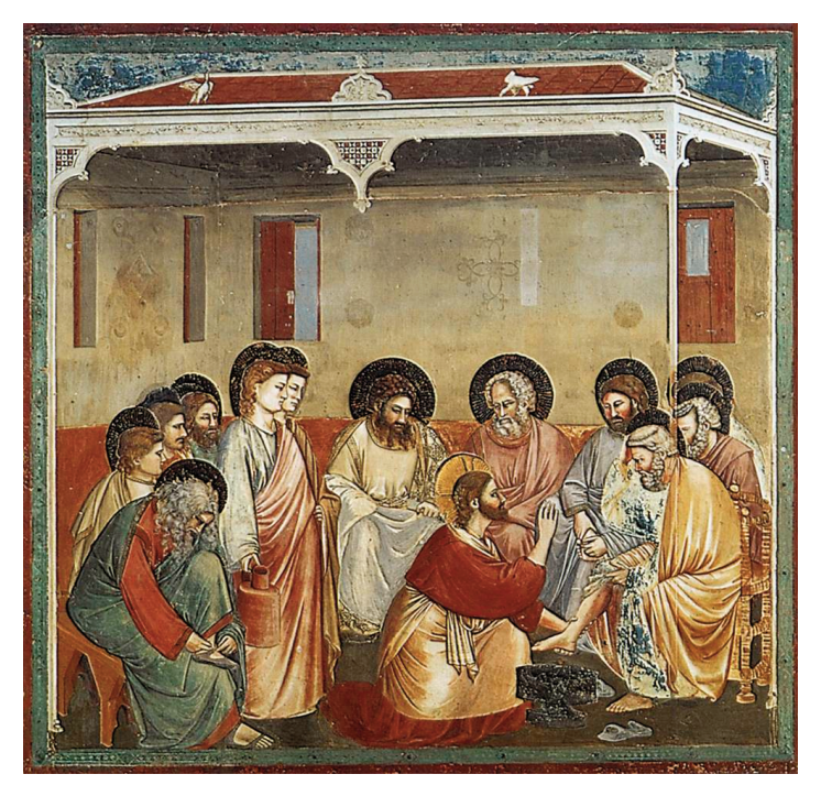
Washing of the Feet, Giotto, Scrovegni Chapel

O God, who in creating the human race willed that man and wife should be one, join, we pray, in a bond of inseparable love these your servants who are to be united in the covenant of Marriage, so that, as you make their love fruitful, they may become, by your grace, witnesses to charity itself.